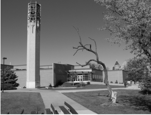
The Johnson & Wales Event Center

This years December Chapter Meeting was held at the Johnson & Wales Event Center. The format was changed to a Mystery Dinner. It was put on by, and benefited, the Criminal Justice Association at Johnson & Wales.